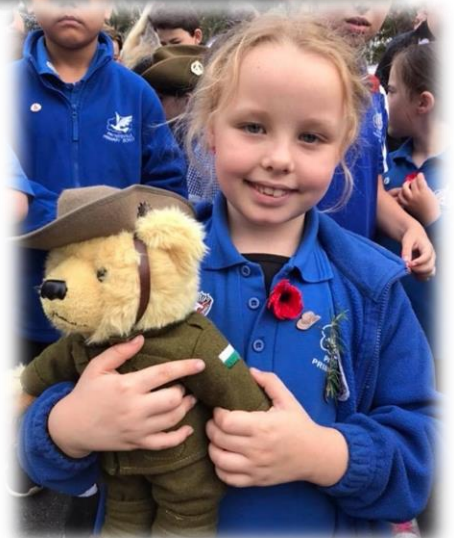
PAYNESVILLE STUDENTS ATTENDING ANZAC DAY SERVICE WEDNESDAY 25 TH APRIL AT PAYNESVILLE RSL.