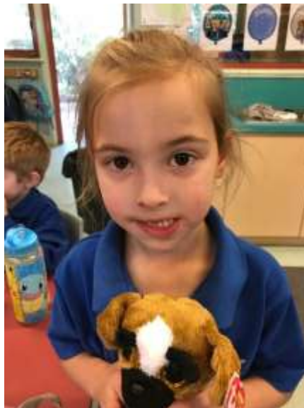
Bella – She gives us treats.