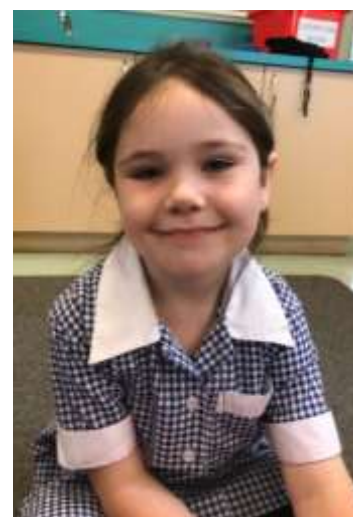
Alanis: She let's me eat icecream at night time.