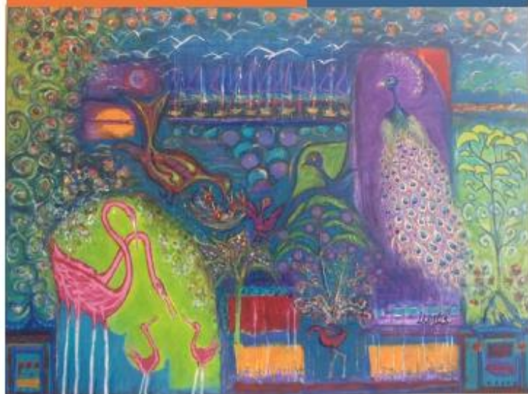
Fundraising Event for Raymond Island Community Garden