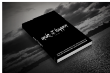
Make It Happen – Paperback book