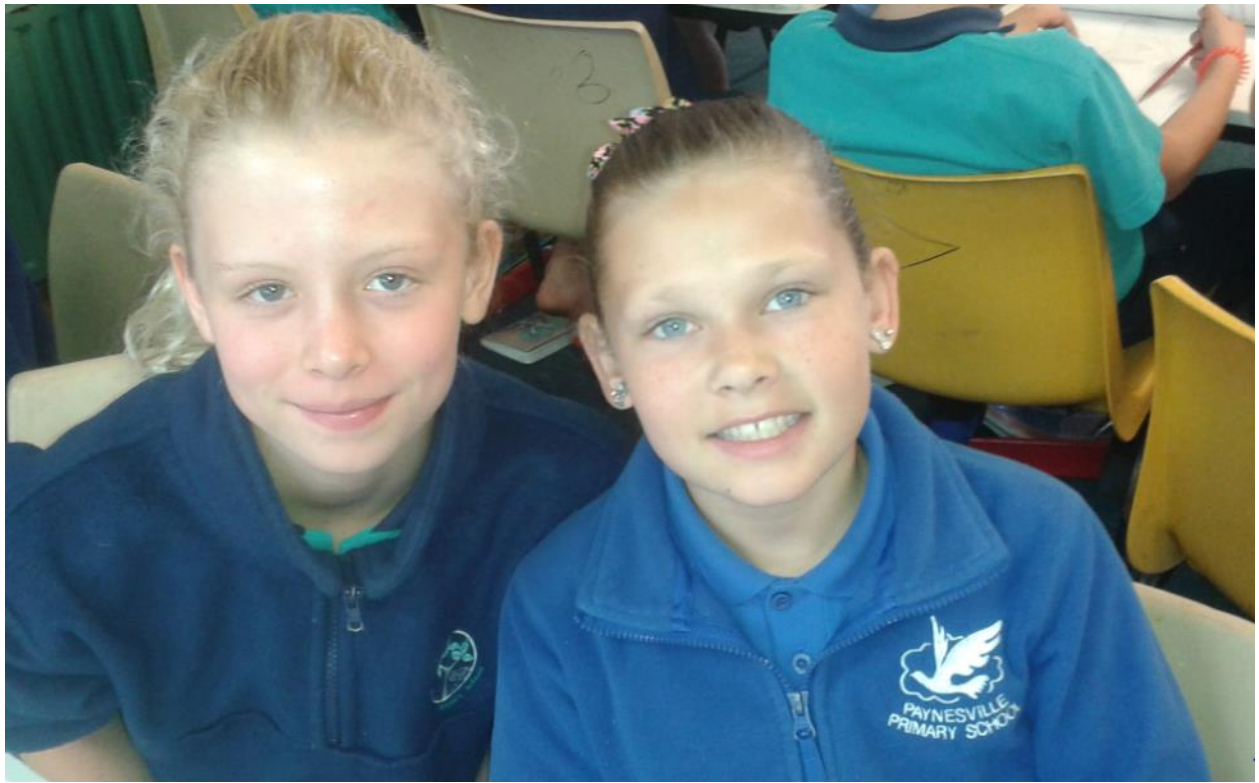
Poppy and Holley enjoyed hanging out with each other.