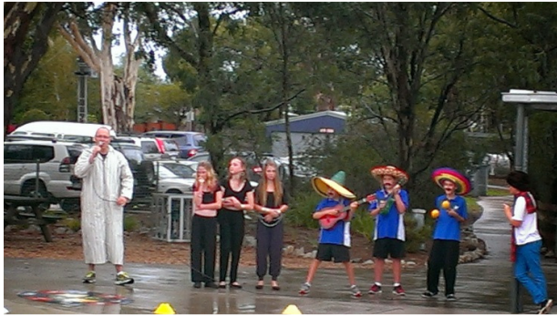
Above: Our Moroccan MC with belly dancing hosts, accompanied by the three amigos at our "round the world parade"!